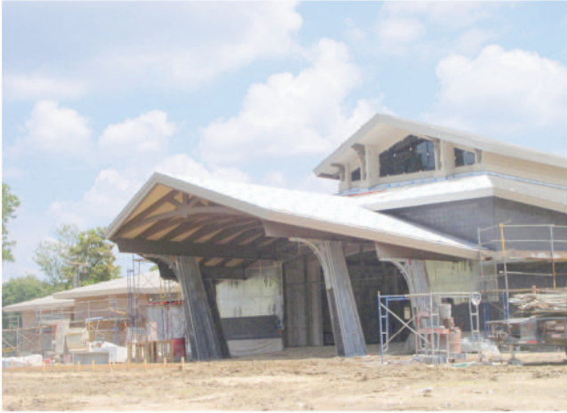
Fairwood Branch Library under construction in August