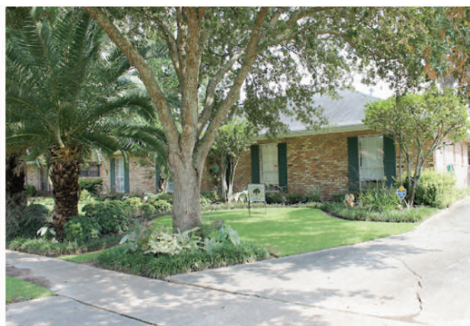
Trudy Solomon, 12550 Lockhaven (August)