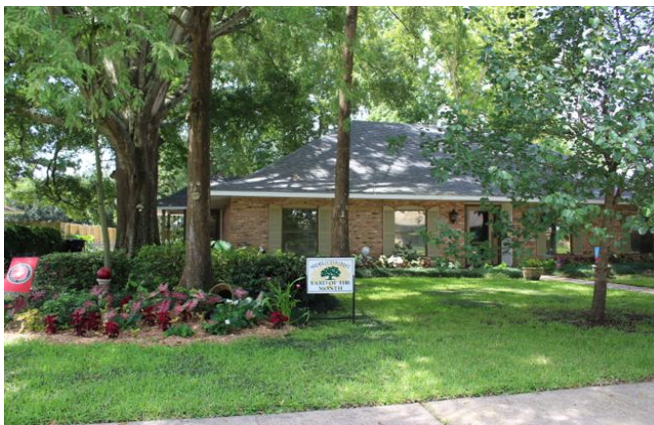
ALICE ELOFSON 12570 E. MILBURN