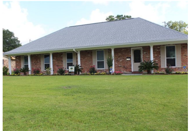
HOLLY & TON NGUYEN 12251 MOLLYLEA