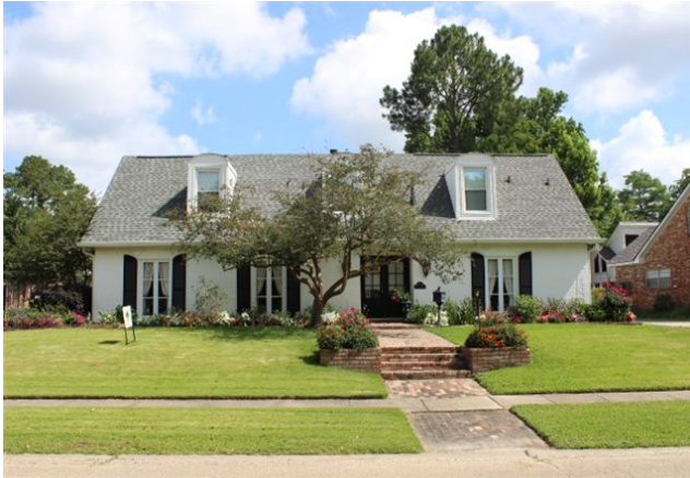
TW & IRIS TERRAL 10869 GOODWOOD BLVD