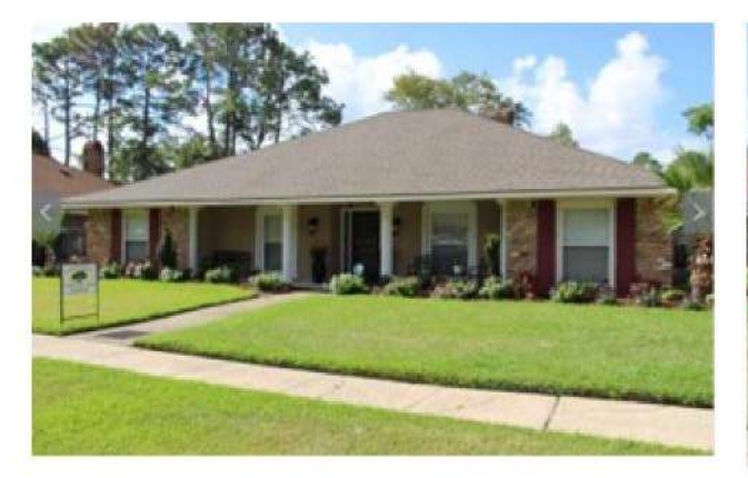
Chiquetta Brock (August)