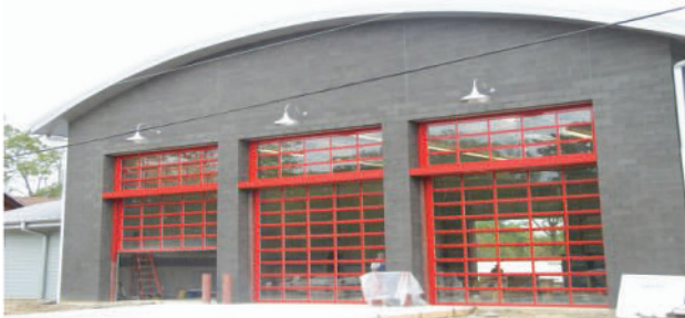
Watch the media and the SFCA website for news of the ribbon-cutting ceremony for Baton Rouge Fire Station No. 13 on Sharp Road. Construction is almost complete, and the opening ceremonies are tentatively set for late April or early May.