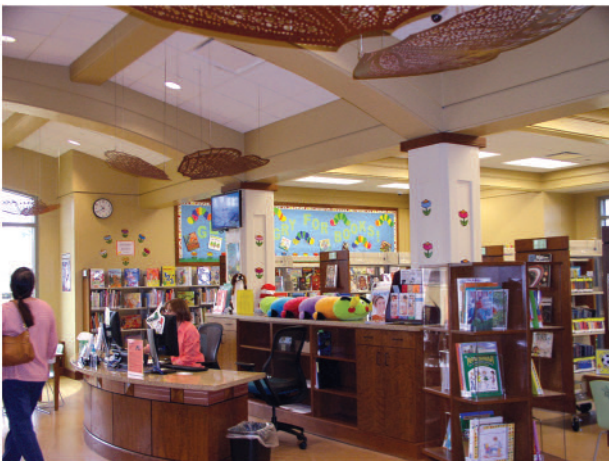
Interior of Fairwood Branch Library

Everyone needs to share in the expense of keeping Sherwood Forest a vibrant, desirable place to live.