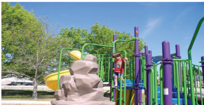
"Kaboom!" playground is open at BREC Flannery Road Park